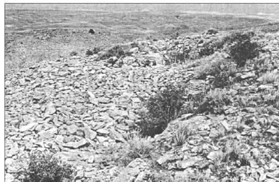
Cobble discarded into a pit or trench quarry