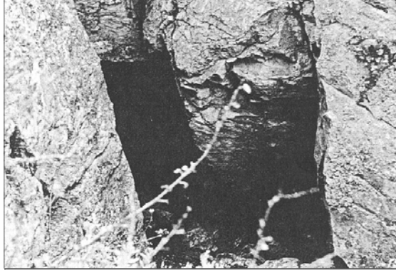
A shaft in one of the Spanish Diggings quarries