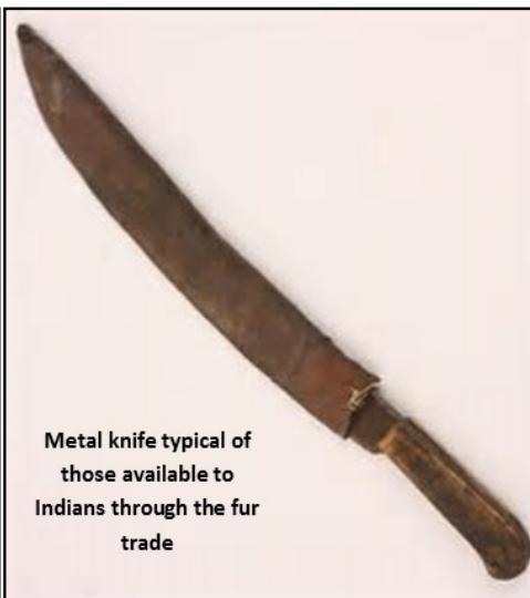
Metal knife typical of those available to Indians through the fur trade